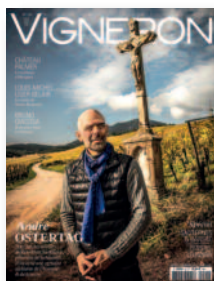
N° 20 - SPRING 2015