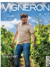
N° 26 - FALL 2016