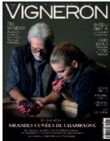
N° 23 - WINTER 2015-2016