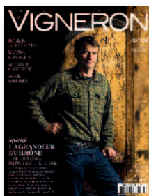
N° 30 - FALL 2017