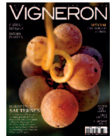
N° 32 - SPRING 2018

Receive VIGNERON the French quarterly magazine ABOUT EXCEPTIONAL WINE MAKERS AND WINES