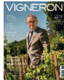
N° 22 - FALL 2015