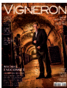
N° 27 - WINTER 2016-2017