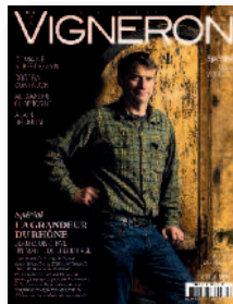
N° 30 - FALL 2017