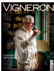
N° 24 - SPRING 2016