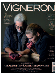
N° 23 - WINTER 2015-2016