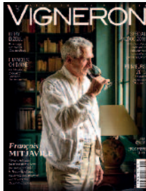
N° 24 - SPRING 2016