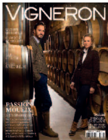
N° 28 - SPRING 2017