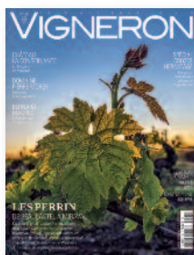
N° 25 - SUMMER 2016