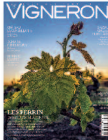
N° 25 - SUMMER 2016