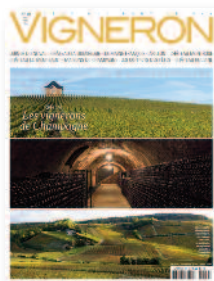
N° 19 - WINTER 2014-2015