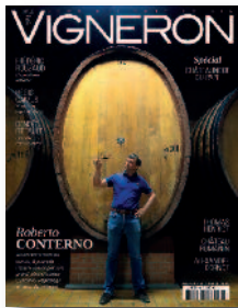
N° 18 - FALL 2014