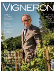
N° 22 - FALL 2015