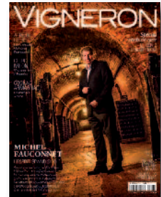
N° 27 - WINTER 2016-2017