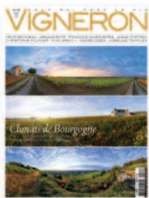
N° 16 - SPRING 2014