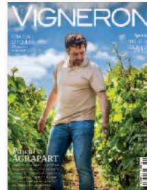
N° 26 - FALL 2016