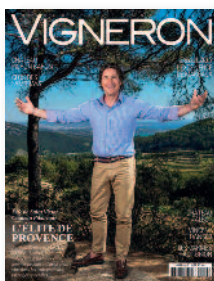
N° 29 - SUMMER 2017