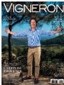
N° 29 - SUMMER 2017