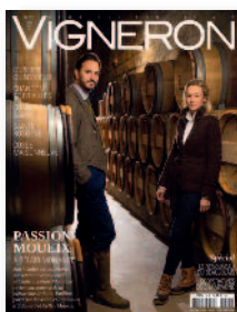
N° 28 - SPRING 2017