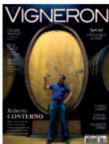
N° 18 - FALL 2014