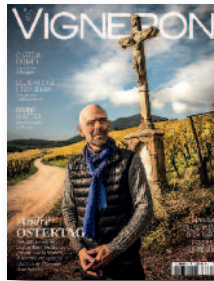
N° 20 - SPRING 2015