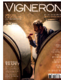
N° 31 - WINTER 2017-2018