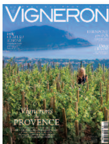
N° 17 - SUMMER 2014